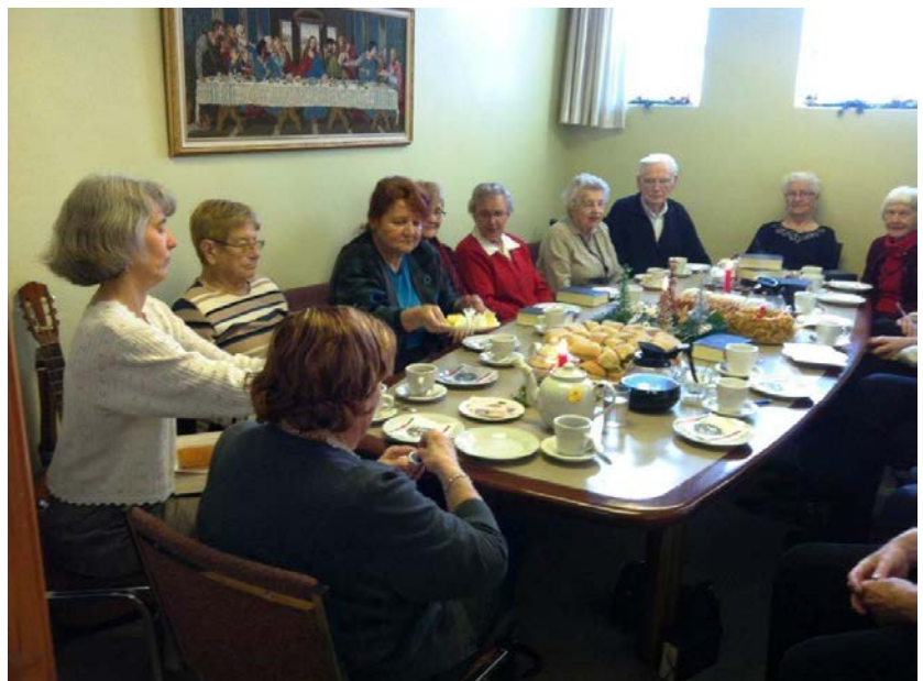
Advent 2012 Celebration of our Ladies' Group.

Dan Sommerfeld, together with several helpers, organized the cleaning of carpets and the waxing of floors in our church. A big thank-you for this very helpful effort!