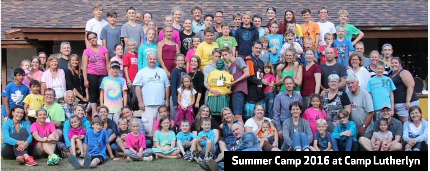
Summer Camp 2016 at Camp Lutherlyn