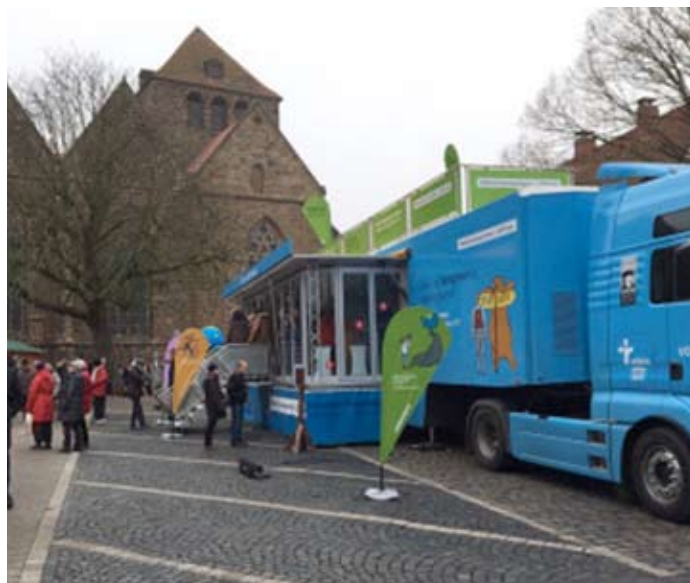
The truck shown in a beautiful setting on the Martini-Kirchhof in Minden

Sibiu and Dublin, from Rome and Turku, from Zürich, Villach and Schmalkalden, from Worms, Augsburg and Osnabrück and from all the other stations to the Luther-town Wittenberg. Travel Stories are not just happening on 67 stations between November 3, 2016 and May 20, 2017 in the “story mobile truck”, but are also available any time online. Accompany the truck on its tour and live (or relive) what stories unfold on this journey.