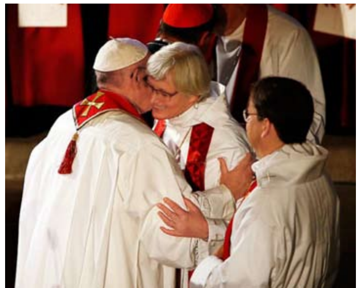
Pope Francis and Antje Jackelén, Archbishop of Uppsala, offer each other the peace of Christ during the joint commemoration in Lund Cathedral.

Faith and baptism in Christ, they state, "demand of us a daily conversion, by which we cast off the historical disagreements and conflicts that impede the ministry of reconciliation." They acknowledge that "while the past