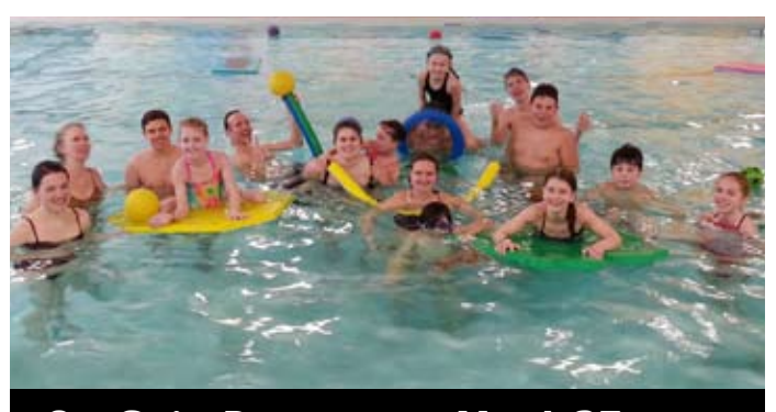
Our Swim Party was on March 25