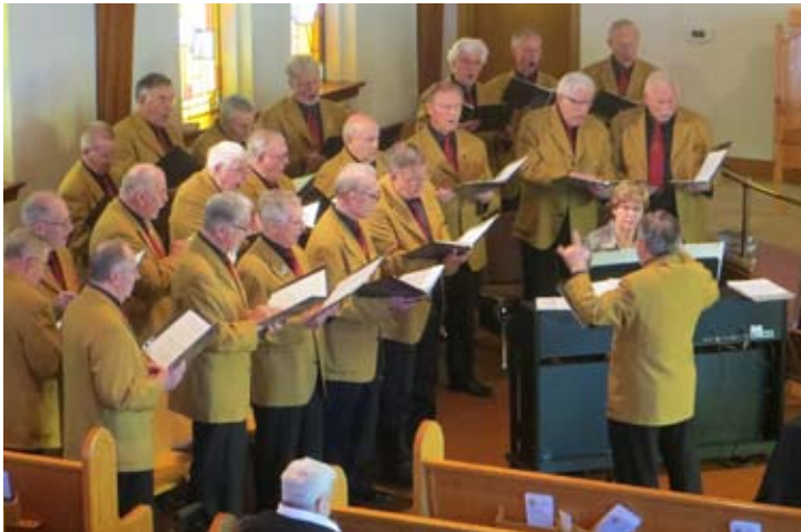
Harfentöne on Palm Sunday