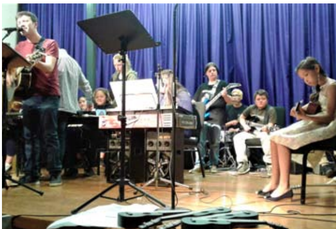
The after school program „Music for the Spirit“ with Six Nations of the Grand River, Ohsweken, Ontario