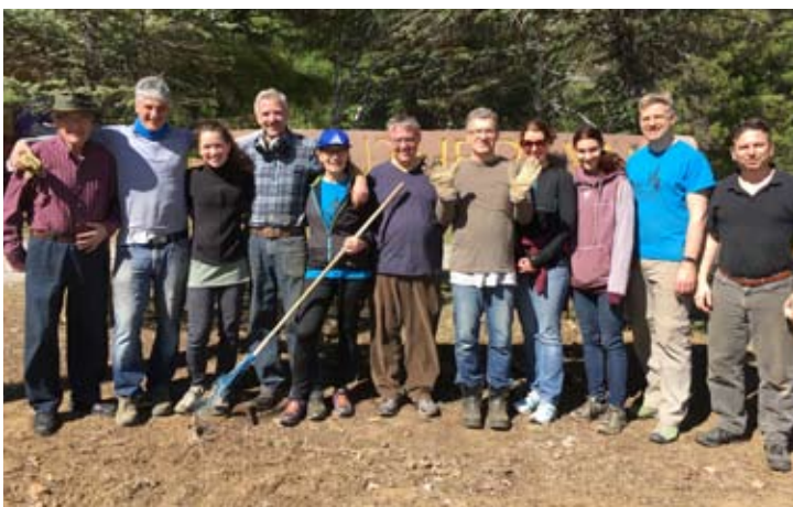
Spring Cleaning at Camp Lutherlyn, April 29