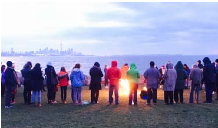
Easter Sunrise Service