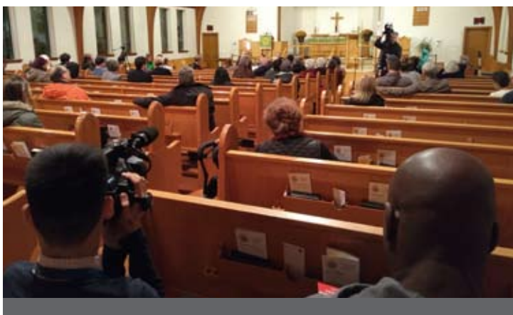
Transit Townhall in October