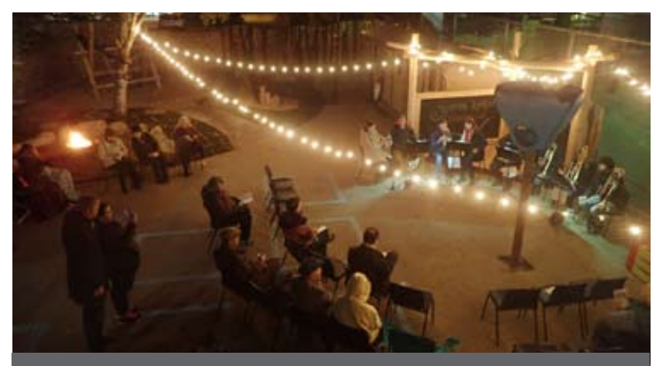
Concerts by Brass Ensemble from Germany at New Daycare Playground