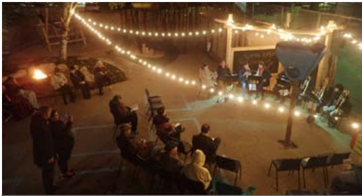
Concerts by Brass Ensemble from Germany at New Daycare Playground