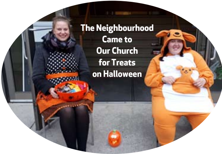
The Neighbourhood Came to Our Church for Treats on Halloween