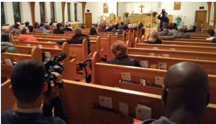
Transit Townhall in October