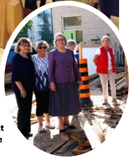
The Käthe Kollwitz Exhibit at the AGO and tour of the new playground