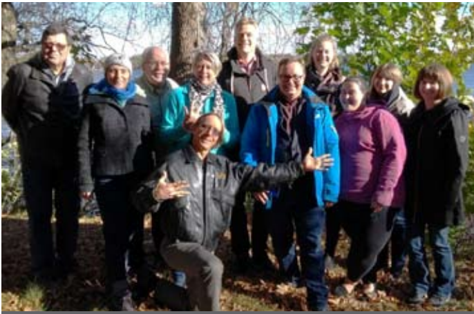
The Volunteers from Martin Luther Church

Another working group provided the opportunity to set goals within the framework of newly acquired knowledge. A report of the conference and the resulting objectives will be fine-tuned at the November church council meeting. The greatest challenge was identified as being the degree of willingness to innovate with new members of the congregation.