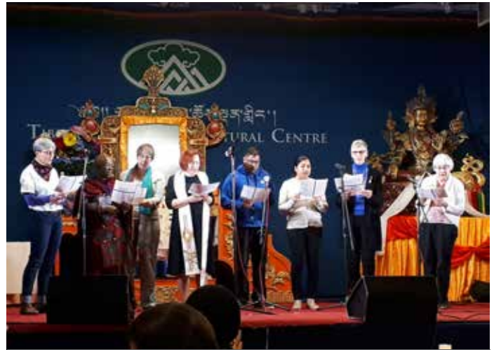
Lakeshore Interfaith Festival, April 14, at the Tibetan Cultural Centre