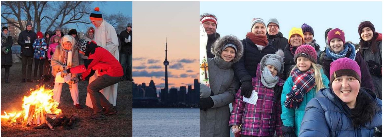
Easter Sunrise Service at Humber Bay Park West, April 1, 2018