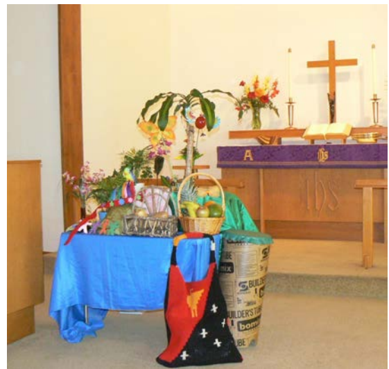
On March 1, the children of the Sunday School decorated a table with many interesting things from Papua Newguinea.