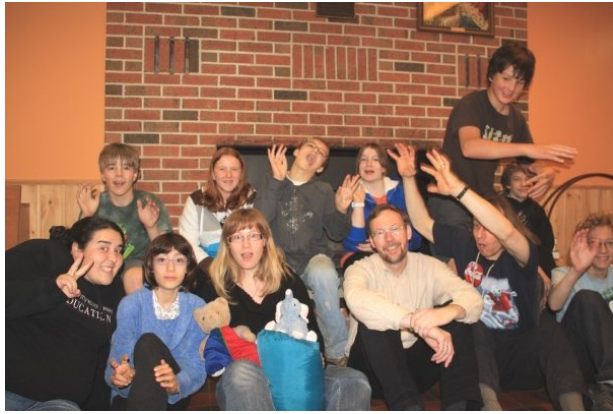
Confirmands' Weekend in Camp Edgewood April 24 – 26, 2009