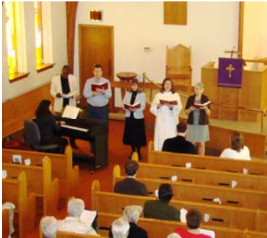
Joint Celebration with Wesley Mimico United Church on March 15, 2009 with their wonderful gift of tambourines for our Sunday School