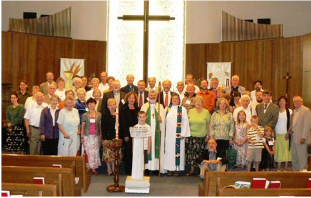
53 participants met at the General Meeting of the DELKINA (German Evangelical-Lutheran Church Conference in North America) in Kelowna.