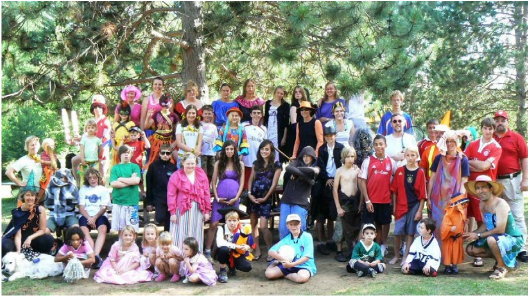
A large and joyous group got together at the Summer Camp.