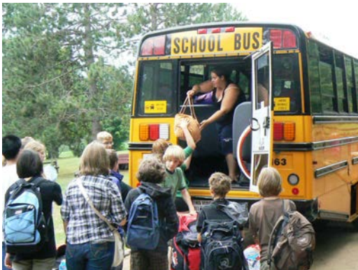
Bruno's Bus was brand new and absolutely super!

In spite of the not always sunny weather, everyone had much fun during swimming and canoeing, white water rafting and sports activities.