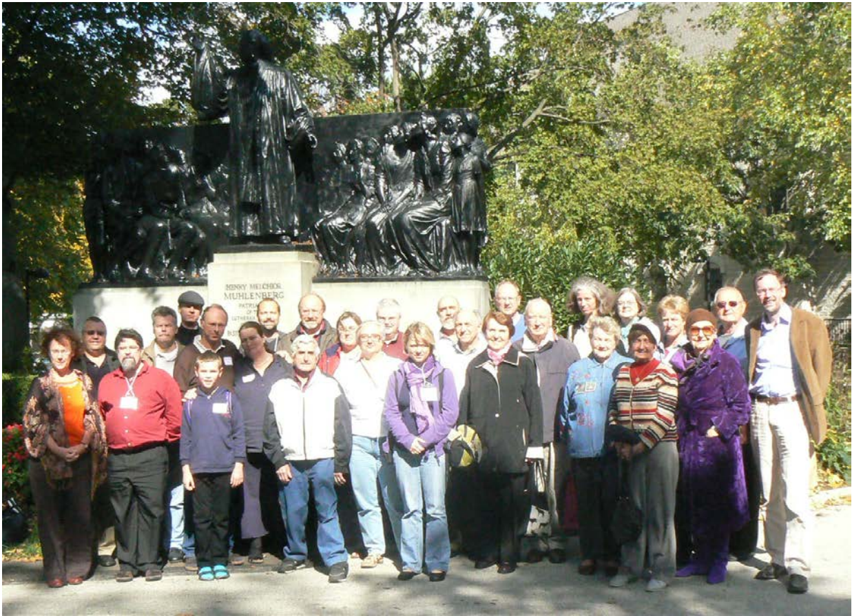
The DELKINA-group in front of the Muehlenberg Monument of the Lutheran Theological Seminary Philadelphia, in October 2011

Martin Luther Evangelical Lutheran Church 2379 Lake Shore Blvd. West, Toronto, ON M8V 1B7 Telephone: 416-251-8293, www.martinluther.ca