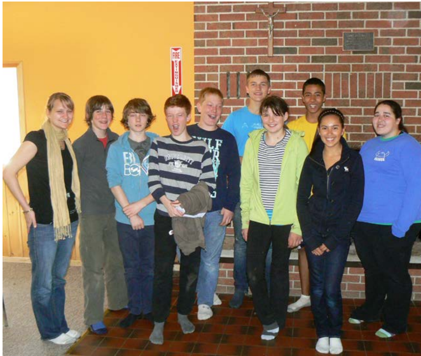
Confirmands' Retreat in Camp Edgewood, April 27 - 29

On Pentecost Sunday, May 27, these will celebrate their confirmation: