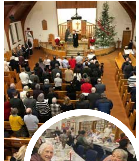
Christmas Eve 2023