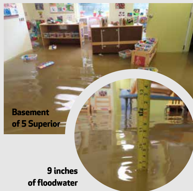
Basement of 5 Superior