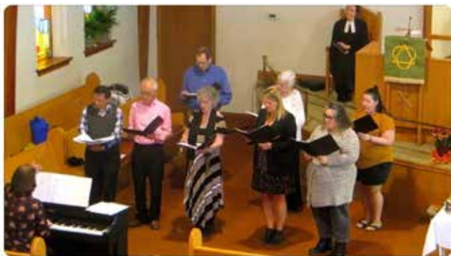
German Thanksgiving, Oct 6, 2024